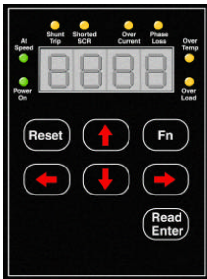
Simple to use keypad operator