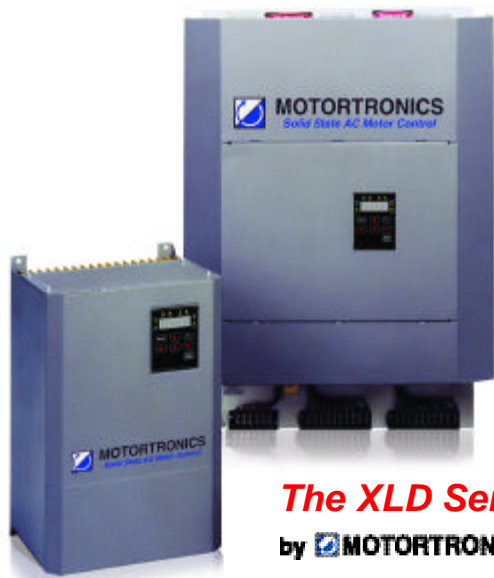
The XLD Series by MOTORTRONICS